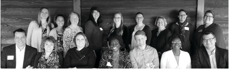
Pictured here are some of the 2018 Community Impact Volunteers

Community partnerships and a focus on results are at the core of Head of the Lakes United Way's (HLUW) move to Community Impact. This approach demands that communities are proactive as well as responsive to the area's most pressing needs. HLUW's Community Investment Process requires Volunteer Panelists to review and evaluate partner agency requests for United Way funding and decide what percentage of the request will be granted to the applicant.